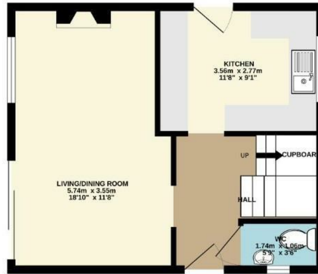
1ST FLOOR 40.4 sq.m. (435 sq.ft.) approx.